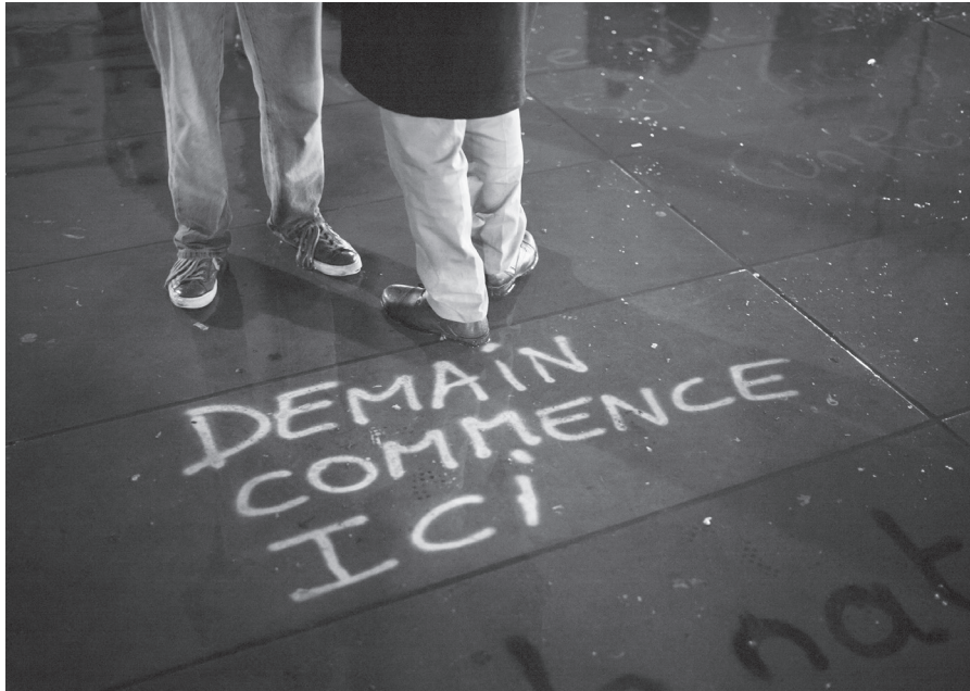
All Rights Reserved - Scam in Place de la République à Paris, Nuit blanche, 30 e Mars 2016

I'll explain to you later how and why I changed. If you are of the same generation as me, you know that we are not condemned to be affected by the same evils all our lives. If you're younger, I want to tell you that some of the things that cause you anxiety are up to you, alongside the perception you have of them. You can free yourself from some of the evils that afflict you in spite of yourself; just as a sky full of lightning is frightening to those who fears the wrath of God, a sky which meanwhile has no effect on the one who knows it's only a natural phenomenon.